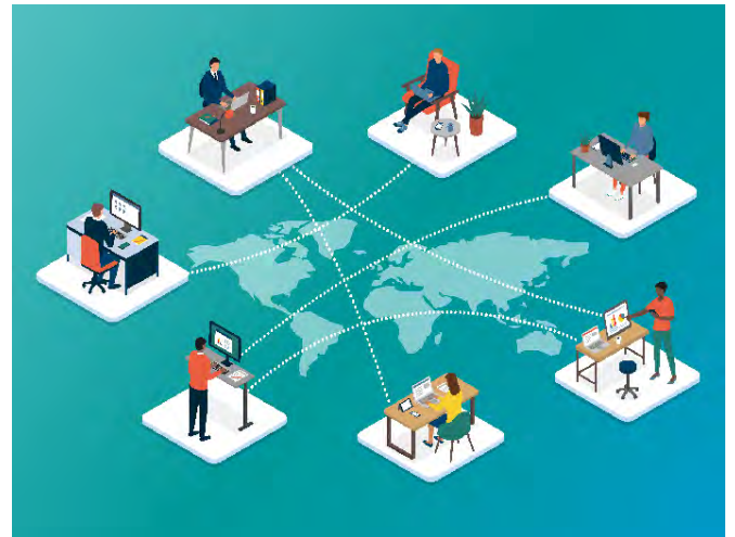
Flexible and secure. System management can be used to support various operators with varying levels of authority making certain you are in control.