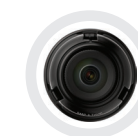
3.7mm LENS MODULE SLA-5M3700Q