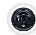
6.0mm LENS MODULE SLA-2M6000Q