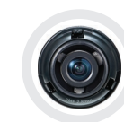
2.8mm LENS MODULE SLA-2M2800Q