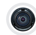
2.4mm LENS MODULE SLA-2M2400Q