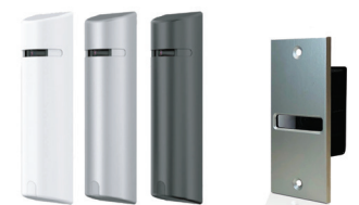
Available in white, silver or black

Video surveillance products must blend seamlessly with the aesthetics of any store structure and layout. You can strategically place Hanwha Techwin’s low-profile remote head camera lens modules and housings near entrances and exits providing investigators and law enforcement with high-quality views of suspects’ faces or any suspicious activity. They are available with flush-mount housings, door mullion lens and multiple color options.