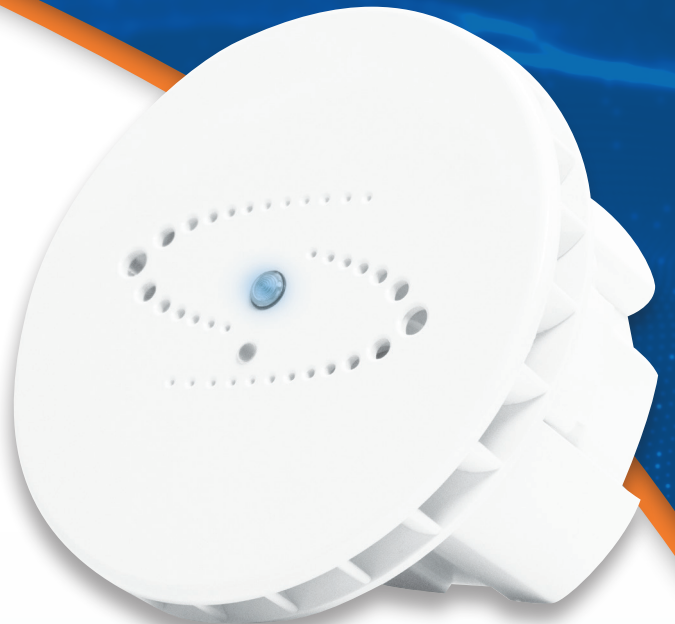
HALO Smart Sensor is Patented.

HALO is a key component in the solution to providing a low-risk environment by monitoring Carbon Dioxide (CO 2 ), Particulate concentrations, Humidity, Volatile Organic Compounds (VOC), and Nitrogen Dioxide (NO 2 ) in the air. HALO delivers safe, healthy, and comfortable environments that keeps all personnel safe while, at the same time, saving money by efficiently running the HVAC system.